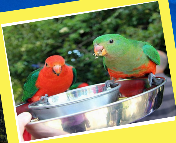
King parrot eating pair.