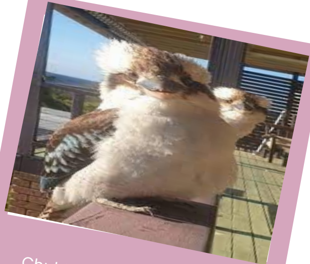
Chubby, fluffy kookaburra