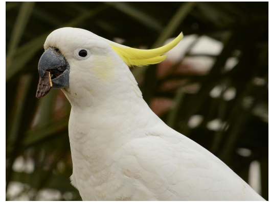
Cockatoo on a tree